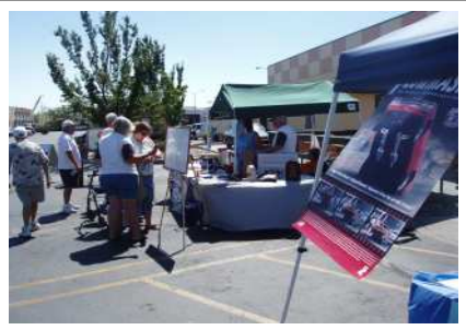
RAFFLE BY: RAY-JAN-JENNIFER

WHAT A FUN SHOW, CLUB MEMBERS---- GREAT JOB!!!!