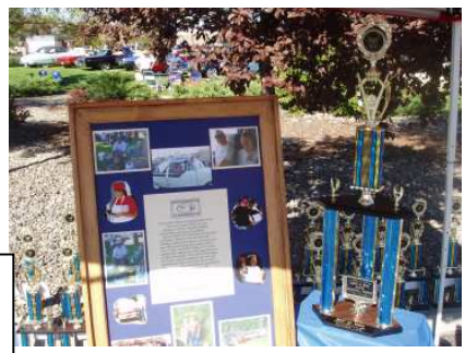
NORM & BIRD MEMORIAL TROPHY