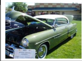
BEST CLUB PONTIAC - STOCK