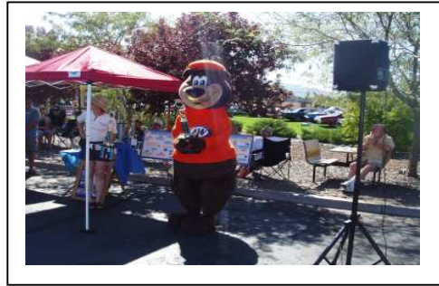
ROOT BEAR HANDS OUT TROPHIES