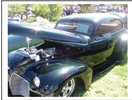
BEST CLUB PONTIAC – MODIFIED